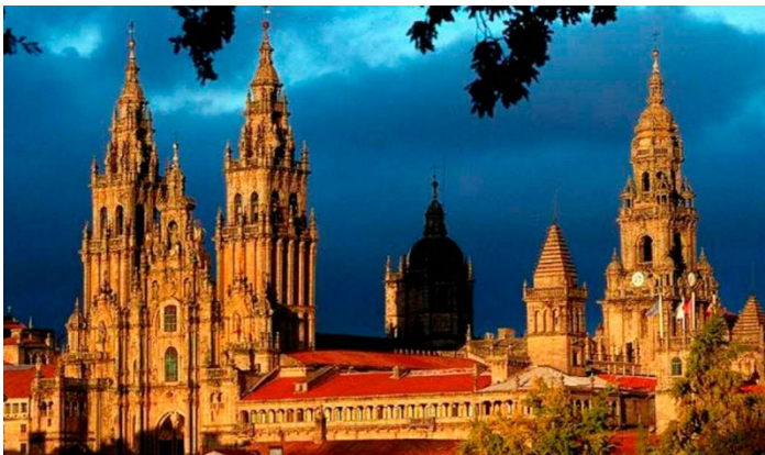
SANTIAGO DE COMPOSTELA CATHEDRAL