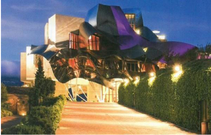
MARQUES DE RISCAL WINERY, LA RIOJA