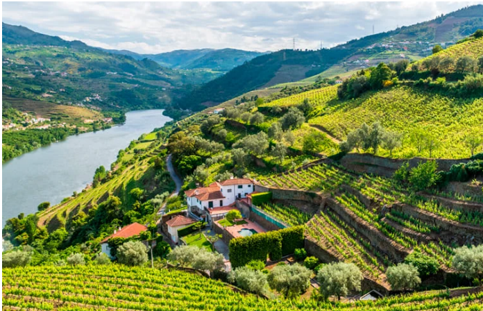
RIBERA DEL DUERO WINE ROUTE