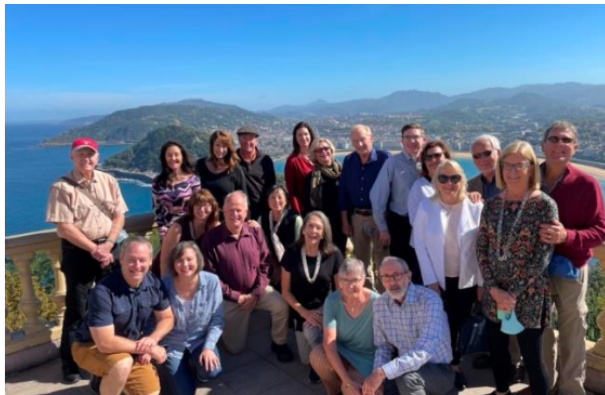
LA CONCHA BEACH, SAN SEBASTIAN