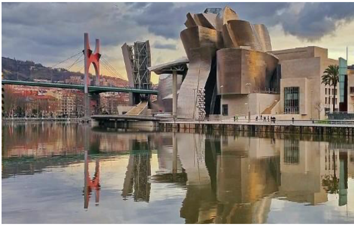
GUGGENHEIM MUSEUM, BILBAO