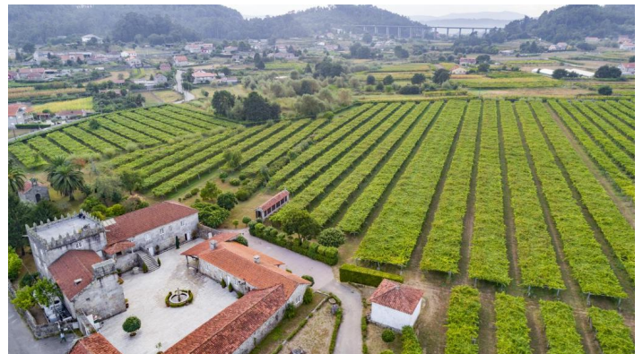
PAZO TORRE PENELAS, FAMILIA TORRES ESTATE IN GALICIA